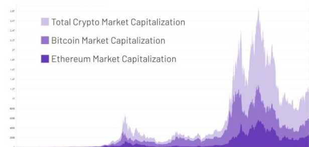
Figure 1: Total market capitalization of the crypto market

The demand for these tokens arises primarily from their utility within the respective blockchain networks and dApps, as they often provide access to specific features, rights, or rewards, making them integral to the decentralized ecosystem and its value creation. Token investments have revolutionized the traditional paradigm of private equity investments by allowing for early, often liquid exposure to emerging Web 3.0 applications. Additionally, they offer investors the opportunity to directly participate in the value appreciation and shaping of the platforms, which would be unthinkable in the traditional financial world.