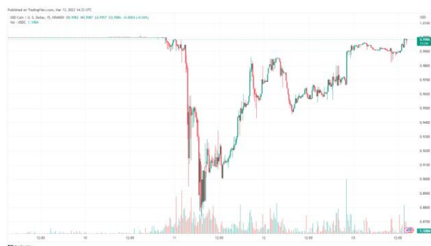
Figure 1: USDC/USD Chart

largest financial institutions, known for its solid balance sheet as a custodian bank. Another billion of Circle's cash reserves is held by the private bank Customers Bank, and the remaining $3.3 billion was held by Silicon Valley Bank (SVB).