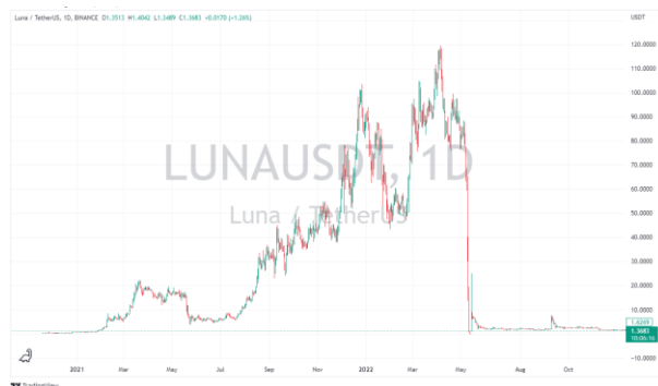
Figure 1: Terra LUNA/USDT Chart

Misfortune rarely comes alone. In the bull market, massive demand for digital assets collided with an equally active and creative creation of various tokens. One novel construct that emerged in this environment was the algorithmic stablecoin UST, whose security was based on newly created seigniorage tokens LUNA. Such mechanisms are essentially designed to function only under steadily increasing demand. And so it happened in the changed environment, as it had to. The then $60 billion construct was overwhelmed within a few days by its own Ponzi-like mechanism. The market value of the entire ecosystem collapsed to less than one billion, leaving numerous market participants with a total loss.