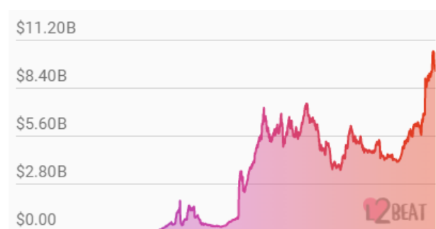
Figure 2: Total Value Locked (TVL) on Layer 2 solutions since 2019

The native token-based Ethereum scaling solutions Arbitrum and Optimism now have a TVL of over 8 billion USD in deposited assets.