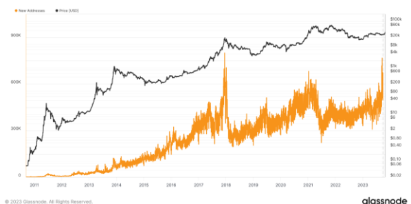
Figure 2: Number of new Bitcoin addresses per day vs. price

Another indicator of network growth is the increasing number of new wallet addresses. This suggests a growing user base and a broader adoption of Bitcoin.