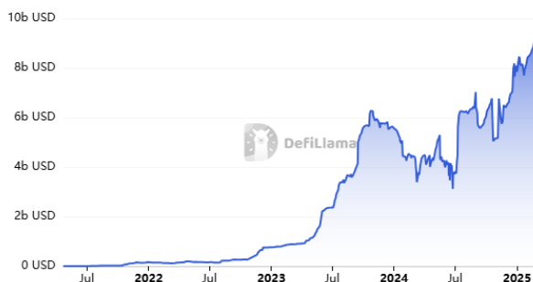
Total value of all tokenized assets

Real-World Assets (RWAs) are tangible assets such as real estate, bonds, or commodities that are digitized and made tradable through blockchain technology – a concept that is gaining increasing importance. Stablecoins were the first RWAs and brought real-world currencies like the US dollar to the blockchain, laying the foundation for the tokenization of more complex assets. Larry Fink, CEO of BlackRock, has repeatedly highlighted this trend, emphasizing that "tokenization will revolutionize the way we trade and manage assets."